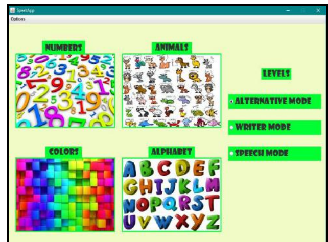
Fig.1: Tool design.