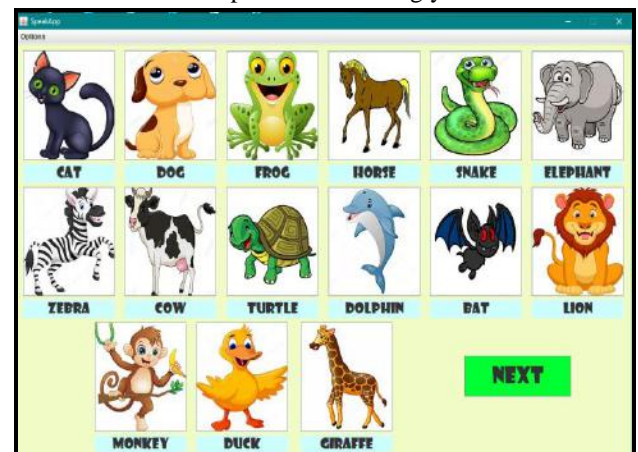
Fig 2: Training Screen.

In the initial screen that is the menu, are presented four representations containing each one, a theme, whose each one of the subjects can be identified by the characteristics of the image, that is well illustrative and of easy identification, besides being possible to be distinguished by the name that is above the figure. When the drawing with the title "Colors" (example) is clicked, a new screen is opened (this is the case for all themes), which will be shown below and explained accordingly.